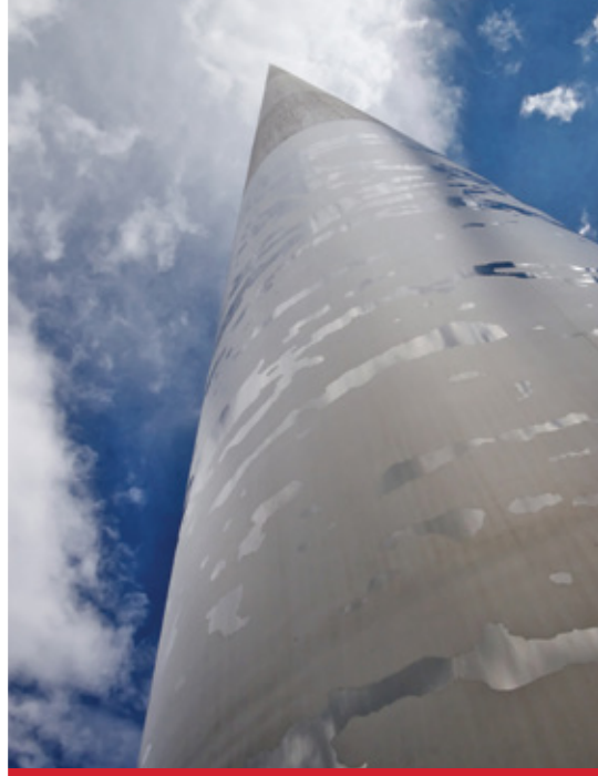
The Dublin Spire – a stunning example of our surface texturing technique showing the versatility of controlled shot peening

Tailoring our services to meet your needs